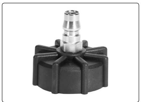
Straight Adaptor - Model No. VS820SA.