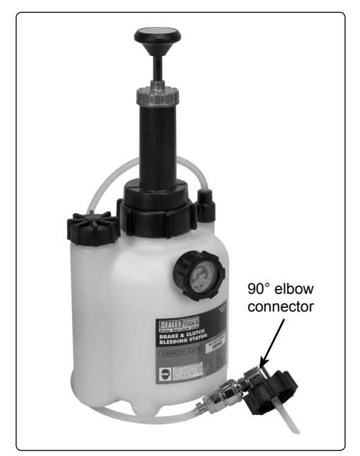
Brake and clutch bleeding system-Model No VS820.V4