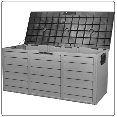
Storage box with lid open