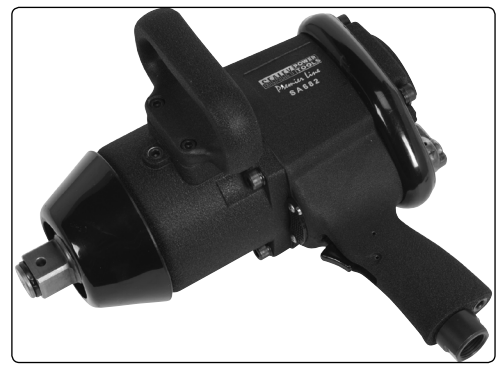
SA682.V3 | Issue: 4(SP) - 18/12/13